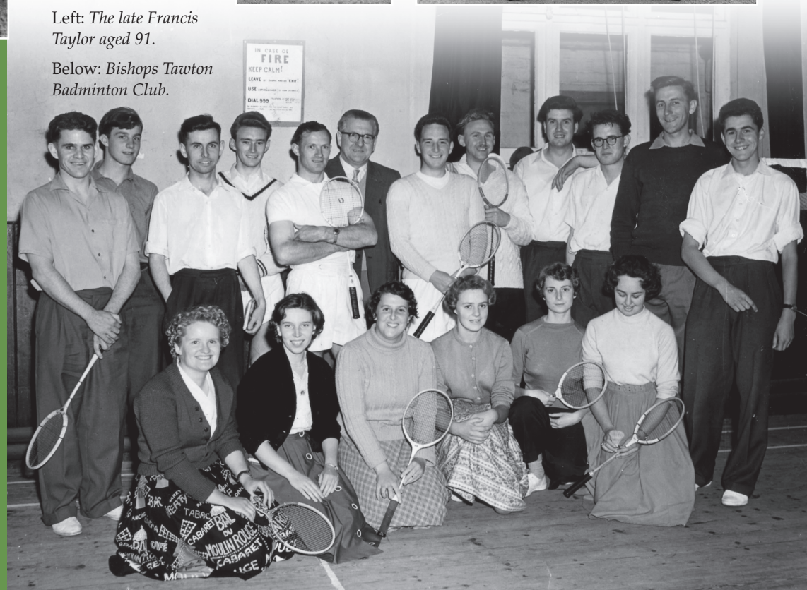
Below: Bishops Tawton Badminton Club.