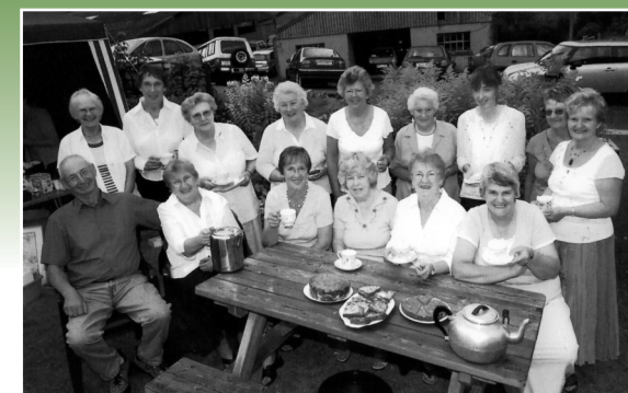
Above right: Refreshments at Whitemoor Farm, 2004.